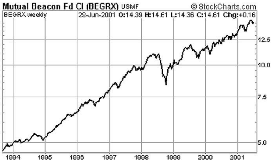
FIGURE 30.1 Mutual Beacon Fund's Performance, 1994–2001.