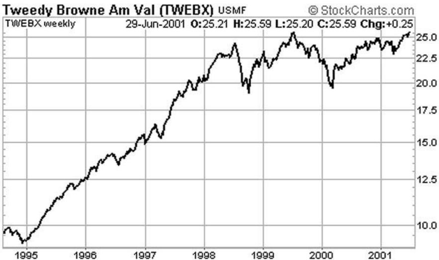
FIGURE 24.1 Tweedy, Browne American Value Fund's Performance, July 1995–August 2001.

The funds share some of the same stocks.