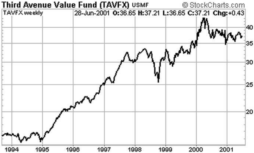
FIGURE 25.1 Third Avenue Value Fund's Performance, 1994–2001.