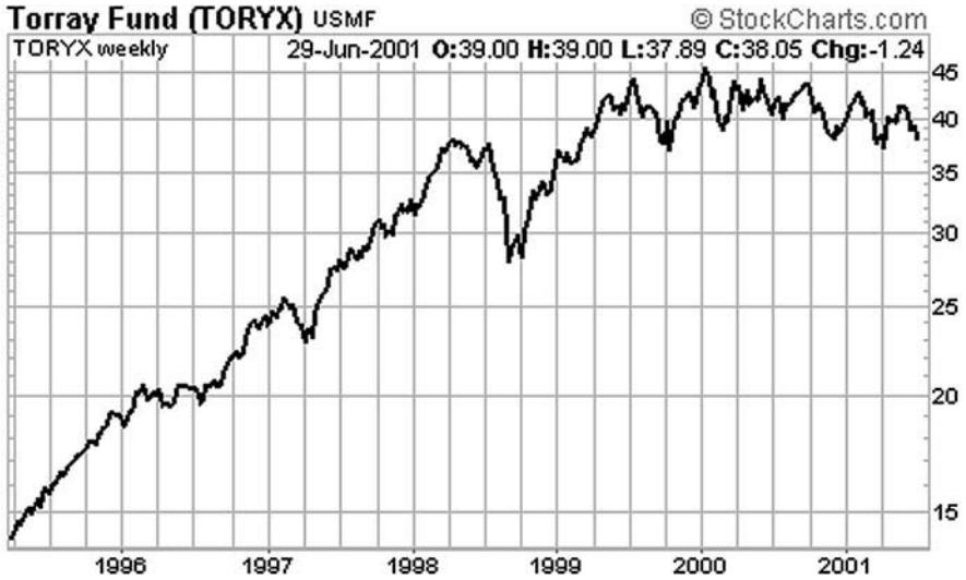
FIGURE 27.1 Torray Fund's Performance, April 1996–April 2001.

One company he bought faced lawsuits because of its use of asbestos. Management airily dismissed the whole subject as unimportant. The issue turned out to be a big problem. Torray sold the stock.