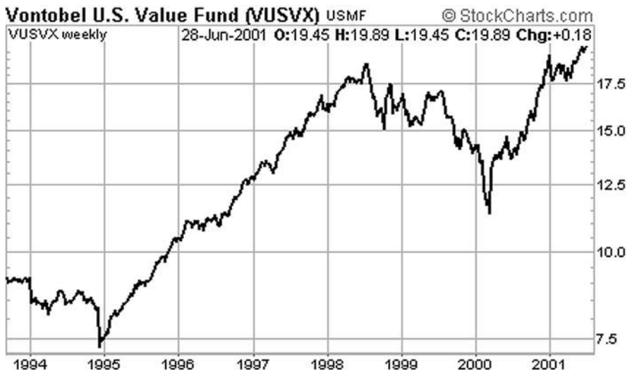
FIGURE 28.1 Vontobel U.S. Value Fund's Performance, 1994–2001.

Even without momentum investors ready to skip without a moment's notice, running a value fund would be no picnic. Today, there are hardly any good companies out there that you can scoop up for a song. "It's a limited universe," Walczak said grumpily. "The potential is very, very narrow. There may be 150 companies good enough for us to buy. There used to be only 50 or 60, but now I'll even consider Intel and Microsoft and Ford—though I haven't pulled the trigger on any of them yet. Not even at their lows. They're not predictable enough."