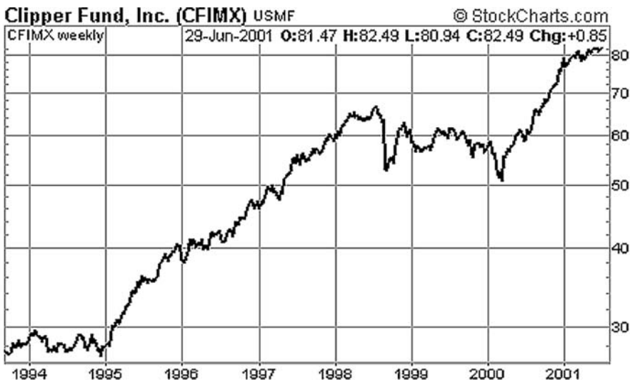
FIGURE 29.1 Clipper Fund's Performance, 1994–2001.