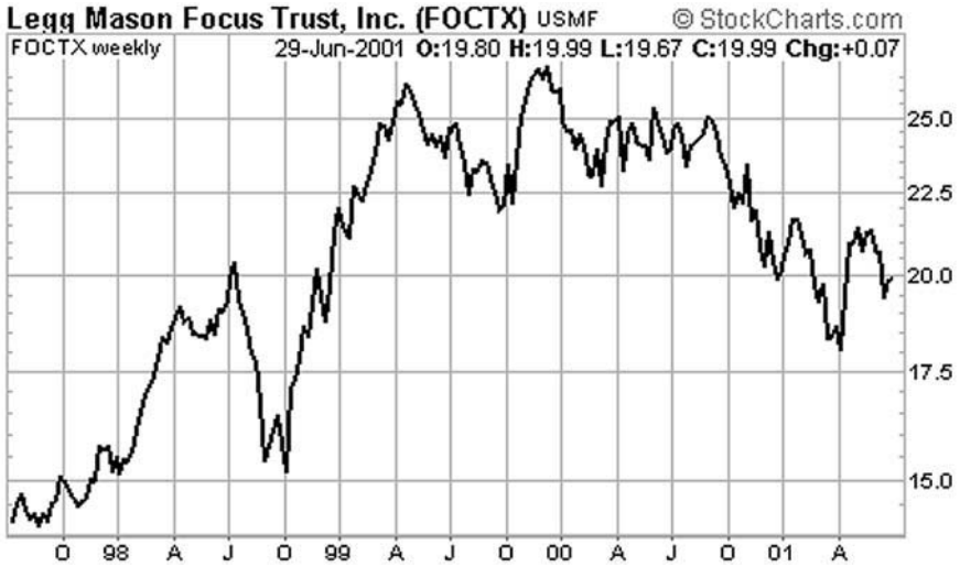
FIGURE 22.1 Legg Mason’s Focus Trust’s Performance, July 1998–April 2001. Source: StockCharts.com.

ratios, and high dividend yields, aren’t special concerns to him now. That wasn’t characteristic of Graham. The Graham strategy—low p-e ratios, low price to book—wasn’t consistently successful after the 70s and early 80s.