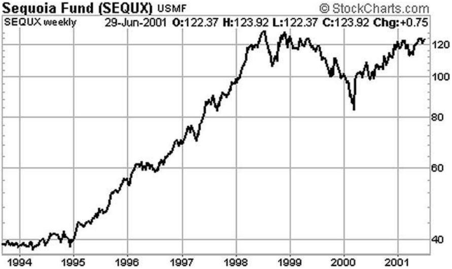
FIGURE 21.1 Sequoia Fund's Performance, 1994–2001.

Ruane's office is in the General Motors/Trump Building—on 59th Street and Fifth Avenue—with green marble and white marble in the lobby. Across the street from the Plaza, à la Vieille Russe, FAO Schwarz, Bergdorf Goodman. Ruane's 47th-floor office—simple and classic, much dark wood, no Quotron machine, no Bloomberg—has a gorgeous view of Central Park and parts north. Tasteful, conservative, interesting furniture. On an end table is Roger Lowenstein's biography of Warren Buffett. (It called Ruane "a straight arrow.") In a bookcase: James Kilpatrick's biography of Buffett, along with many investment books, stuff about Harvard, photos of family, books by Adam Smith, a biography of Bernard Baruch.